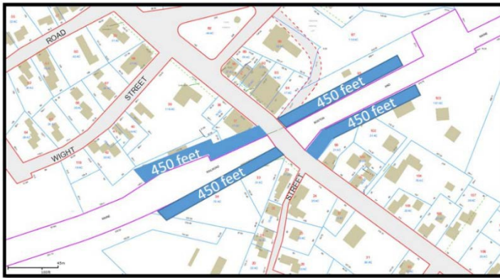
Figure A – Rail Trail at Main Street